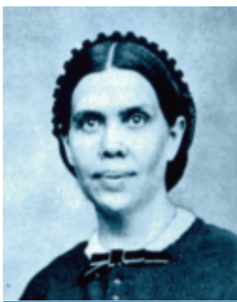
Ellen G. White