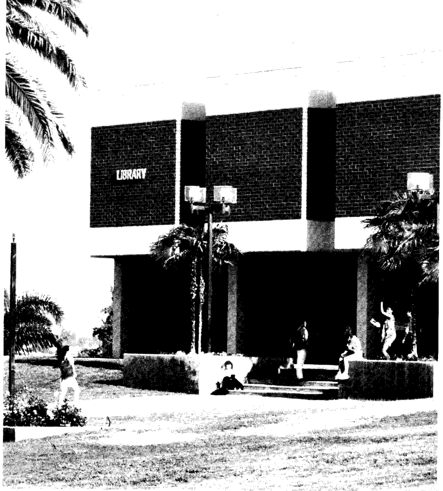
Library, La Sierra University.

This index provides a reference to doctoral dissertations submitted to the School of Education faculty during the 1991-1992 school year. The investigations were part of program requirements for graduate degrees including the M.A. and Ed.D. in administration and leadership and the Ed.D. in curriculum and instruction. M.A. theses are available for U.S. $.10 (10 cents) per page from the Dean's Office, School of Education, La Sierra University, Riverside, CA 92515. (Telephone: 714-785-2266). Copies of the doctoral dissertations may be obtained from Uni-