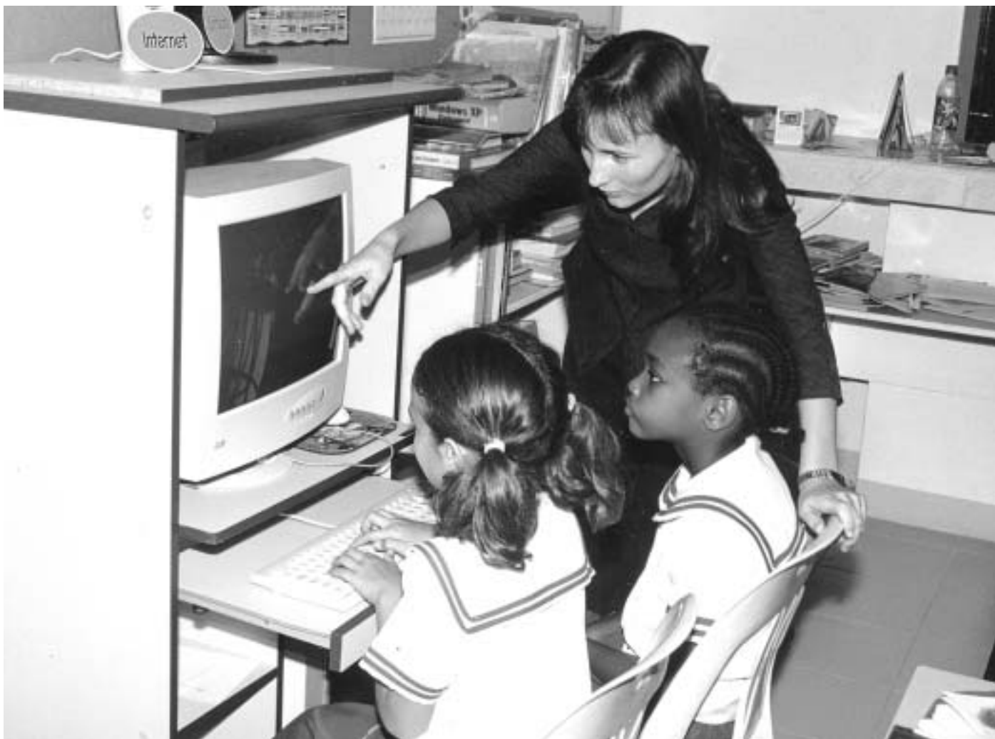
Children enjoy finding books with the online catalog.

is right for you and your library can be a daunting task. As I was doing research for this article, I found that most systems have the same features. What makes the difference between the high-priced systems and the more affordable ones is mostly the optional “bells and whistles.” On pages 32 and 33, you will find two lists: (1) the features that are common to the majority of library-management systems, and (2) school library-automation systems, with company name and contact information, price, and unique and/or special features. Neither list is exhaustive, although I have tried to offer a range of systems, including ones marketed outside the U.S.