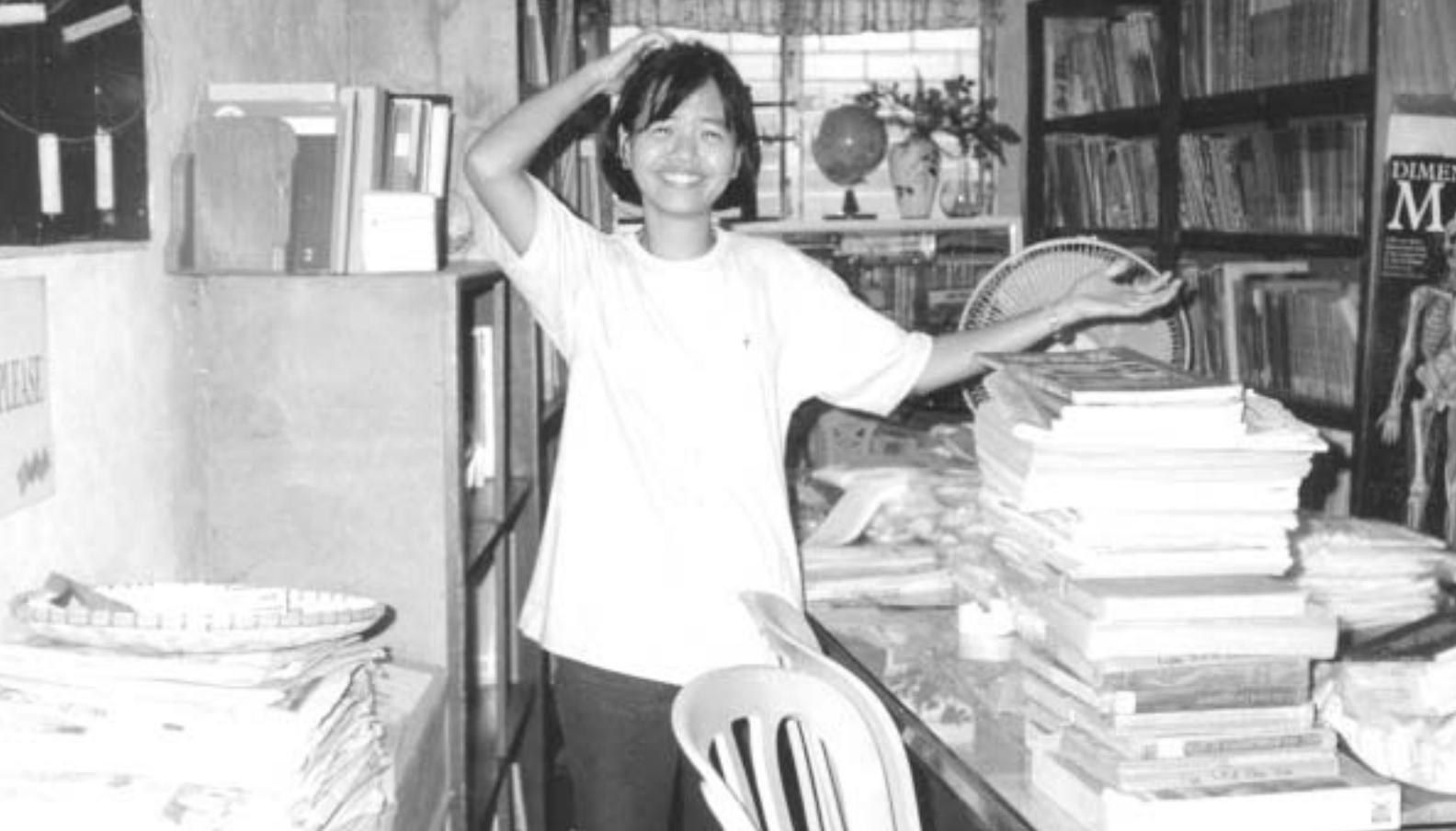
Automating the school library need not be an overwhelming task.