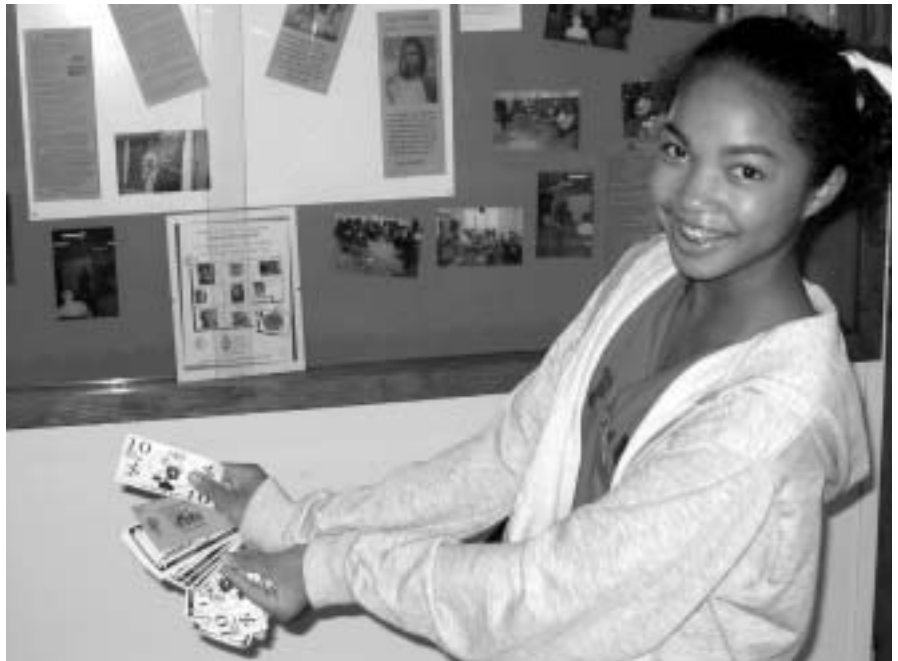
A cheerful participant in the Kids' Wealth project shows off some of the SIFE money she earned during the project by working with her team, answering questions, and figuring out or completing worksheets. Participants exchanged their earnings for snacks during breaks.

But money is not evil. It is simply a tool to be used for good or for evil. We are called to build up God's kingdom. Creating wealth gives us the opportunity to put financial resources to work for God's purposes. Some may call it leaving a legacy, or making a difference for good in one's corner of the world. It is a form of