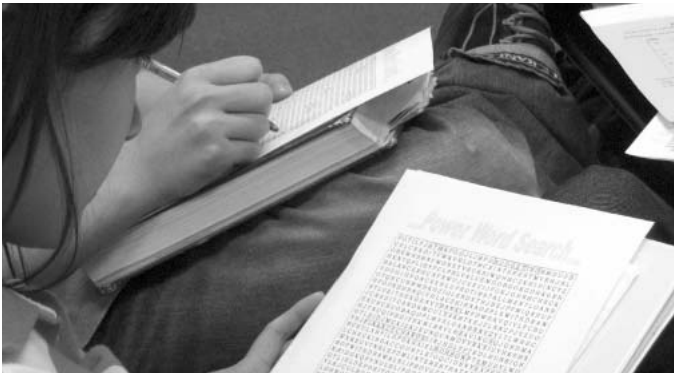
Activities like this word search help students grasp and remember the concepts taught in the financial literacy curricula.