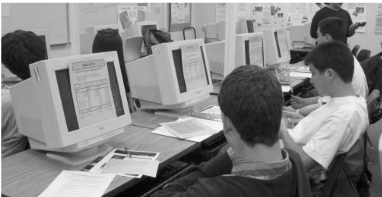
Like everyone else, these high school seniors were amazed to learn the power of compound interest and time through the Rule of 72 lesson, where they quickly see how their money can double in a given number of years, depending on the interest rate they earn on their investments.