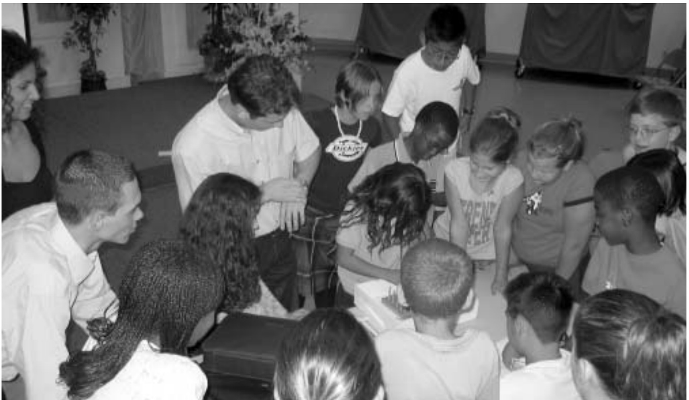
A wooden-peg game teaches these junior high students how to work smarter, not harder—one of the key lessons in the financial literacy curriculum. Eventually, participants figure out the fastest way to set up and remove the wooden pegs from the board.