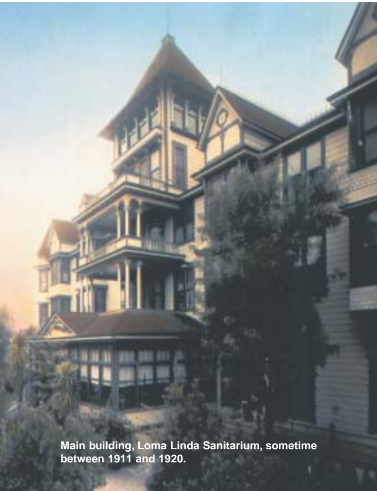
Main building, Loma Linda Sanitarium, sometime between 1911 and 1920.

home instead of incurring the greater expense of sending them to rural boarding schools.