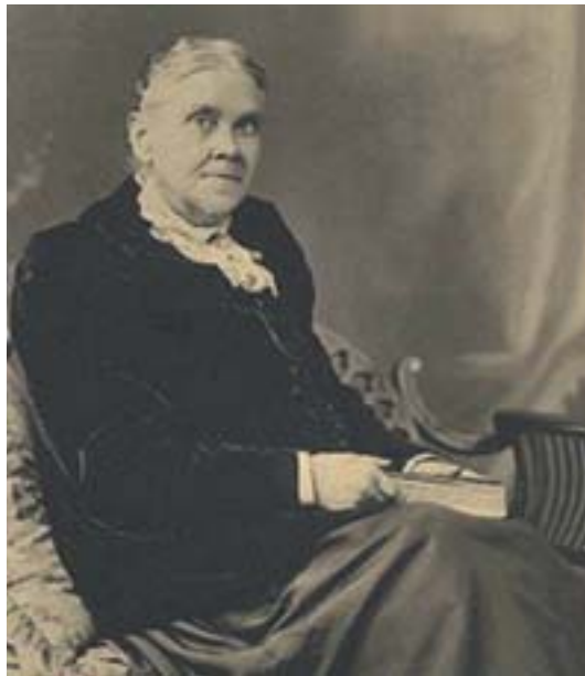
Ellen G. White

Philosophically, Adventist schools differed sharply from their secular counterparts because they replaced the philosophy of the ancient classics with biblical explanations of the source and meaning of human life.