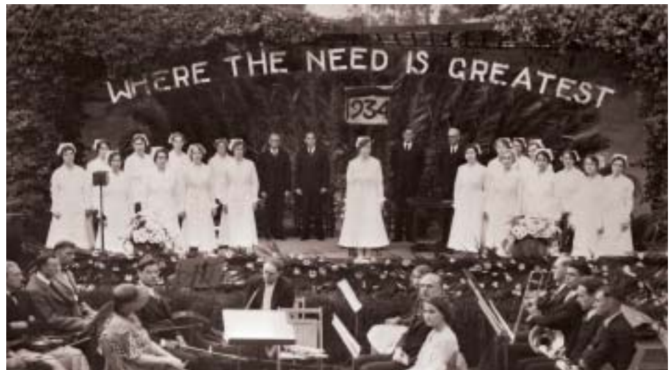
Nurses' graduation, 1934, College of Medical Evangelists, Loma Linda, California.

One of the best-known identifying marks of Seventh-day Adventist education is the oft-quoted statement describing it as a three-part process that encompasses the mental, spiritual, and physical aspects of the human being. This benchmark stems from Ellen White's 1872 advice to Adventist educators entitled "Proper Education," her first essay about education. Curricula should benefit the body as well as the mind, she wrote, and Adventist schools