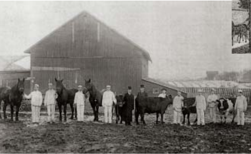
School farms were an important source of income for early Adventist educational institutions.

For the sake of relevancy, educating students to cope with issues of urban life replaced training in the skills of country living.