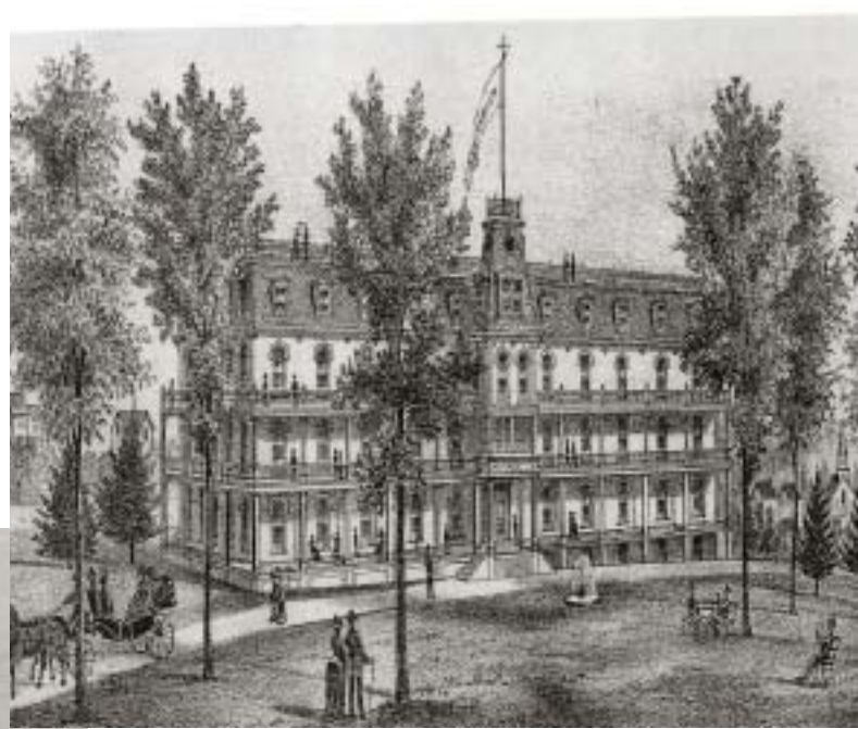
Battle Creek Medical and Surgical Sanitarium, Battle Creek, Michigan.

Ellen White advised that where as few as a half dozen students were available, the church should provide a school. Clearly, Adventist schools were to follow the expansion of the church. The result was day schools that served urban congregations or an institutional community. Often, these schools offered both elementary and secondary education. This enabled Adventist parents to keep their children at