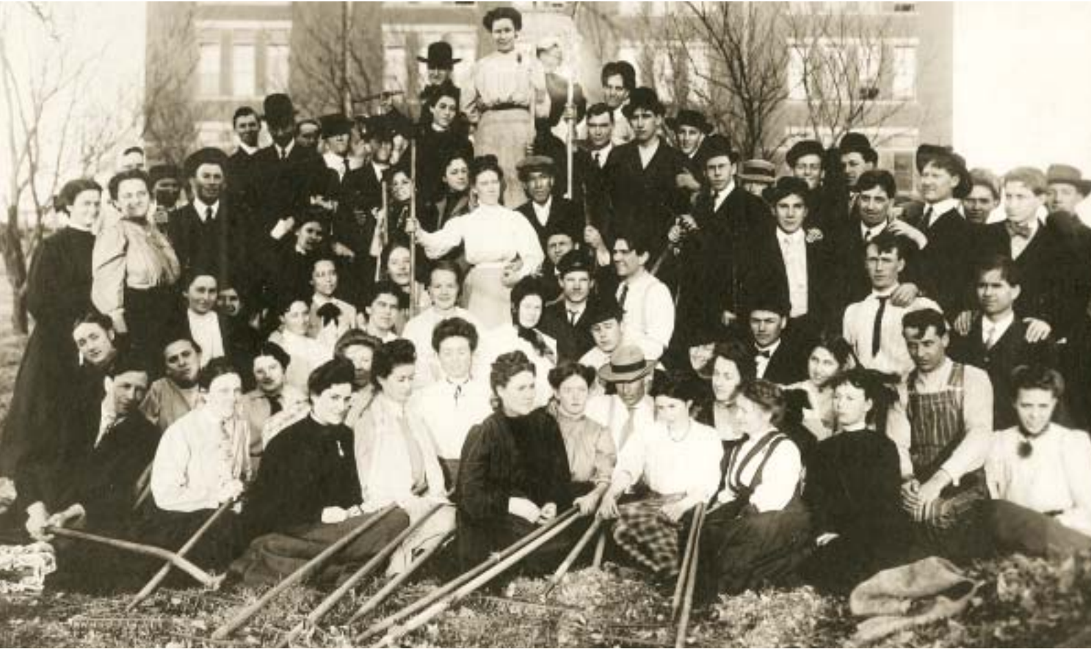
Early school schedules included work assignments for men and women, as depicted in this early photo of Union College students.

Adventists view their venture into education as distinctive because it stresses this triad of values—mental, spiritual, and physical.