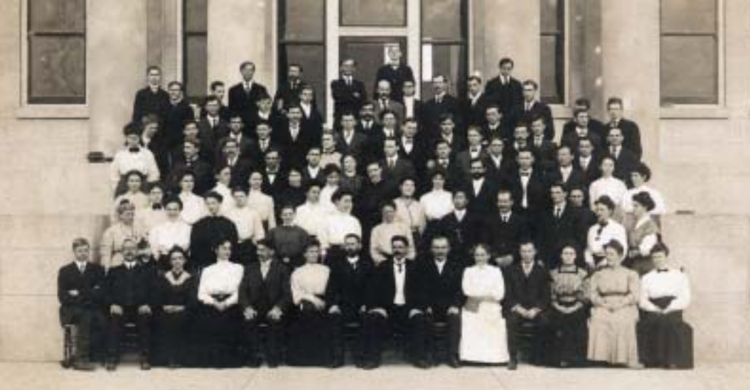
Faculty and students of the Foreign Missionary Seminary in Takoma Park, Maryland, sometime between 1907-1914.

work and homemaking skills, and provide them the means of earning a livelihood with their hands if their professional career goals did not work out. When Adventists began their schools, all of this related largely to an agricultural life because most people lived on farms.