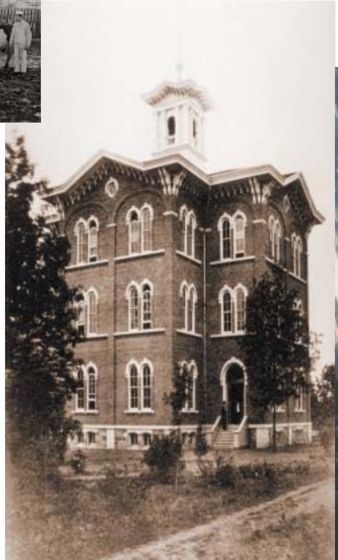
Battle Creek College, Battle Creek, Michigan.