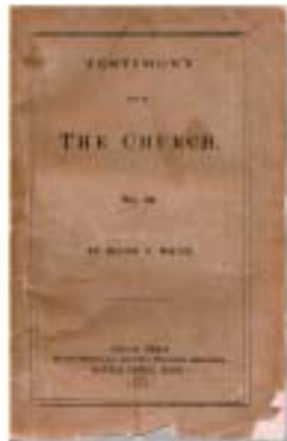
Ellen White's first testimony on education appeared in this 1872 pamphlet.

at the secondary level, elite academies and finishing schools conditioned people to be well bred; and at the college level, education sought to establish people in the origins of Western culture.