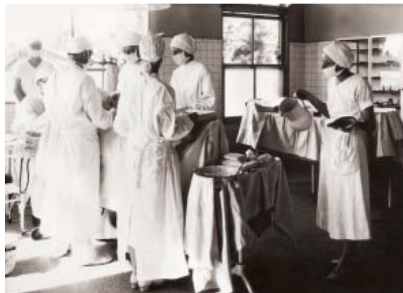
In the beginning, Ellen White recommended short courses to prepare church employees, including medical personnel.

Despite the great importance that Adventists placed on the principle of manual labor and agriculture, denominational urban schools demonstrated that integrating labor with academics was not an absolute for all institutions. Urban schools could fulfill specific needs, depending on local needs. After W. C. White and his mother, Ellen White, attended the European Council in Basle, Switzerland, in 1885,