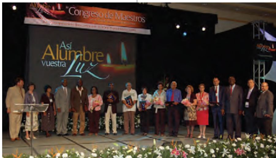
First Inter-American Division Teachers' Congress, 2009

dents and vice presidents, highlight cooperation in different areas such as academic, financial, personnel support, and integration of graduate programs. The first council met in Medellin, Colombia, in 2008, the second in Jamaica in March 2010.