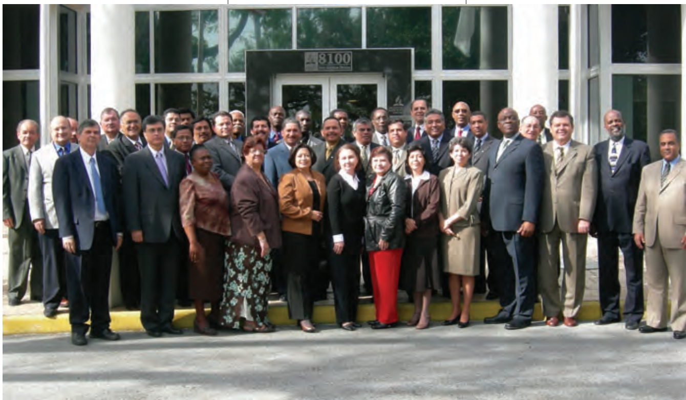
Page 24: Spanish and French grades K-6 textbooks. This page: Center: Poster for Education Symposium. Above: Staff at the Inter-American Division headquarters.

We firmly believe that educational evangelism is an important aspect of our church. We are consolidating a strategic plan for soul winning that will be integrated into the division plans for evangelism.