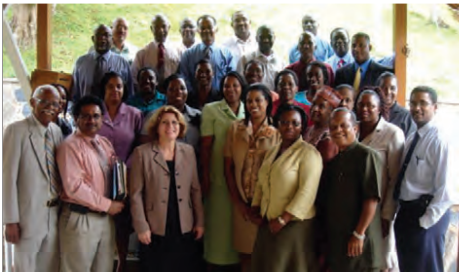
Evaluation and accreditation training program for secondary-level participants

The IAD authorized the offering of the Ellen G. White Medal to recog-