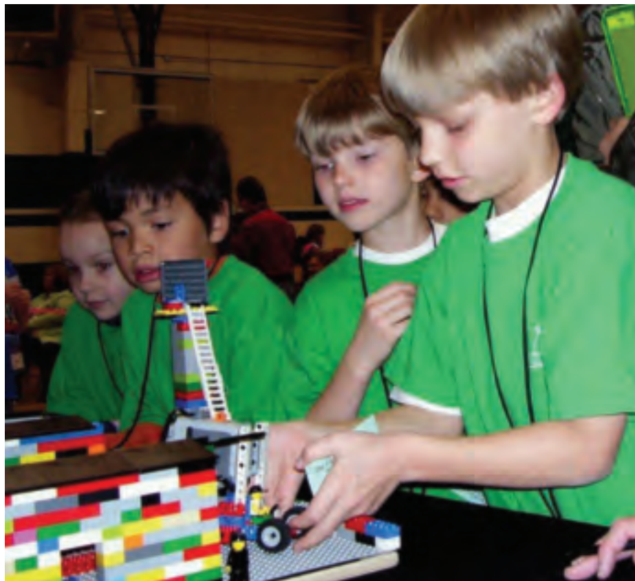
The Lego Robotics Challenge helps students learn the principles of physics and engineering and enhances their communication skills.