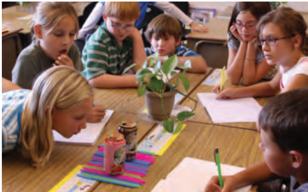
Students learn the scientific process while performing experiments such as this one about The Bernoulli Principle.