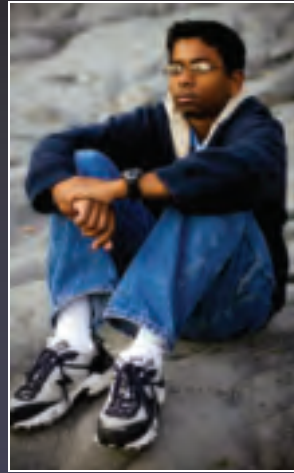
Page 48: Ascension Rock, between the William Miller Home and Chapel in Hampton, New York.