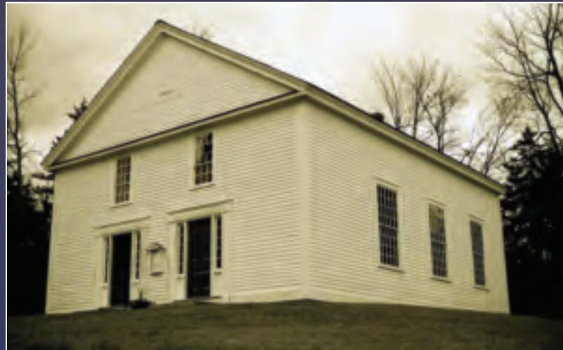
Left: A state historic marker commemorates the "birthplace of the Seventh-day Adventist Church," near the east entrance to Washington, New Hampshire.