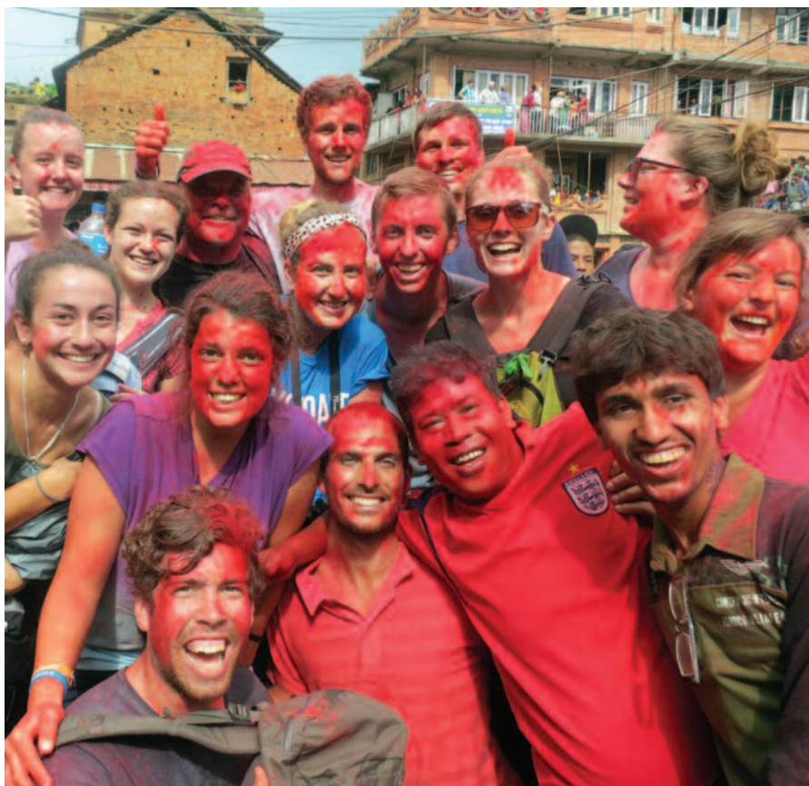
MOTO students and lecturers covered with red dye as part of an annual Nepali festival.

In a study of 10 teachers involved in an overseas professional teaching experience, it was found that this cohort showed increased levels of long-term commitment to the profession of teaching on their return as demonstrated by higher levels of teaching time and higher rates of further study. While this area needs more investiga-