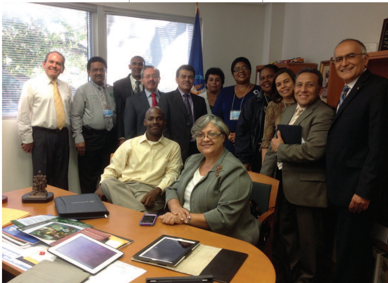
University deans of education who participated in the Bilingual Education Council sponsored by the IAD Department of Education in 2013.

The second division-wide Educational Congress, which had as its theme "The Teacher: A Minister of the Gospel," took place in September 2014 and brought together 1,020 delegates (elementary and secondary teachers, university professors, educational administrators, and directors of education