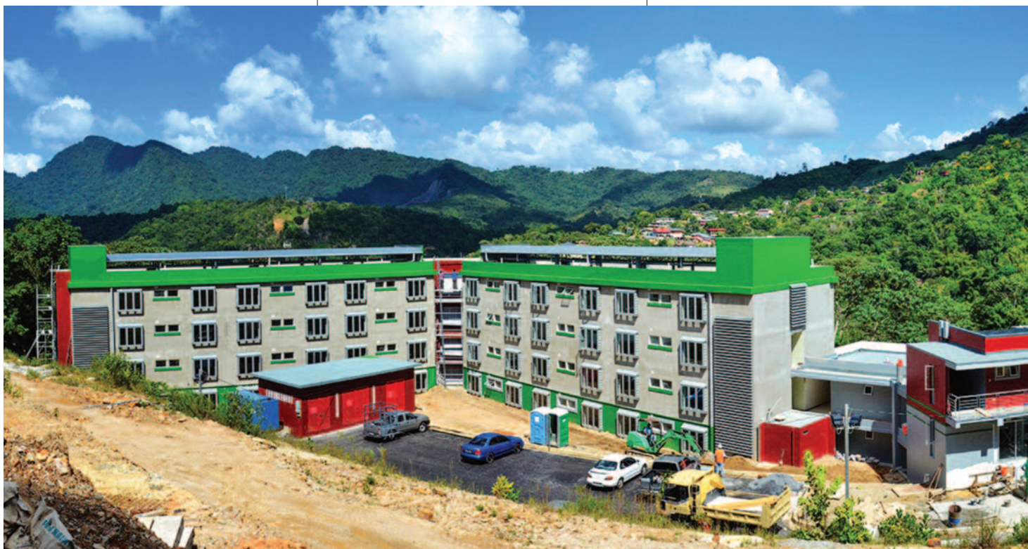
Construction of Greaves Hall, the men’s residence of the University of the Southern Caribbean campus in Trinidad.

The Inter-American Adventist Theological Seminary (IATS), which offers graduate theological education at vari-