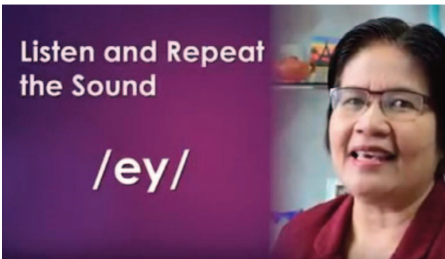
In this video clip, the teacher is modeling how to produce the /ey/ sound.

Through peer assessment, students learn to evaluate the quality of an-