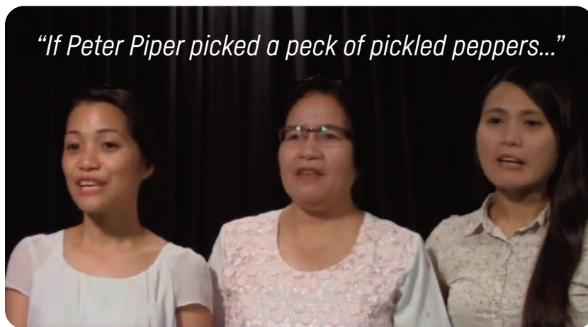
Scene from a video depicting a tongue-twister demonstration.

This strategy encourages students to engage in a process of becoming proficient speakers of the language and mastering language skills based on the modeling provided by the teacher and others. 1 In addition, video production provides the students with an opportunity for self-critique and reflection, 2 essential skills in language learning.