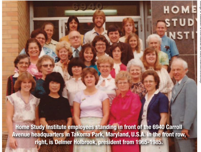
College of Education & International Services, Andrews University.

Today, correspondence schools and distance education continue to play a vital role in the educational development of students in many parts of the world